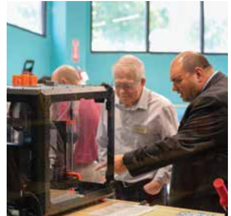
Foundation Board members, Library employees, Glen Ellyn Chamber Board members, Foundation supporters, and local dignitaries gathered for The Workshop ribbon-cutting ceremony and open house.